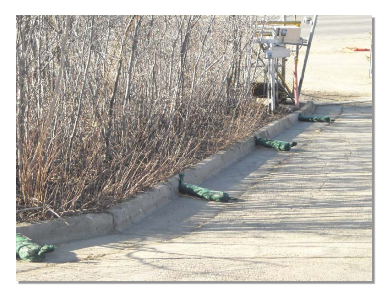
Photograph RS-1. Rock socks placed at regular intervals in a curb line can help reduce sediment loading to storm sewer inlets. Rock socks can also be used as perimeter controls.

Rock socks can be used at the perimeter of a disturbed area to control localized sediment loading. A benefit of rock